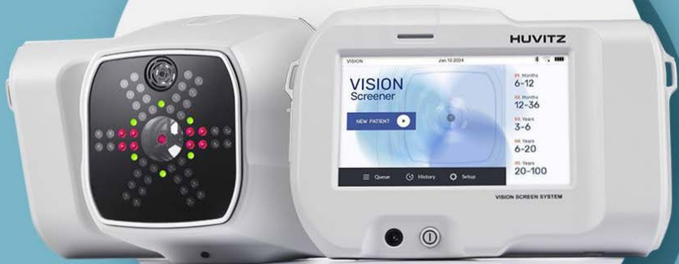
Huvitz Vision Screener HVS-1