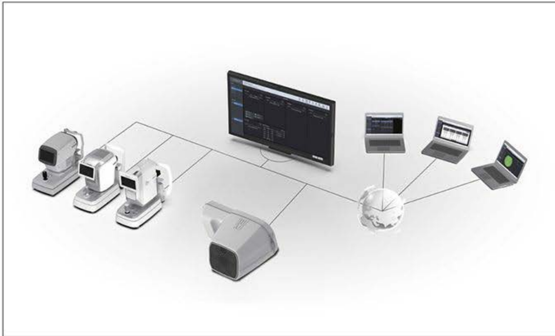
Network in Huvitz Integrated Image Server (HIS-1)