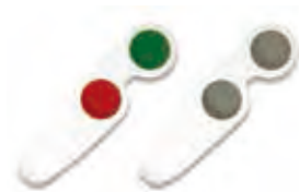
Red Green / Polarization Glasses

* Specification and design are subject to change without notice.