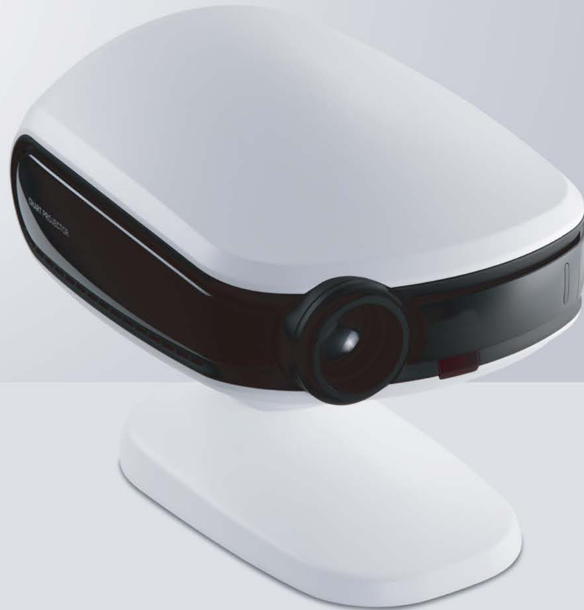
CHART PROJECTOR CCP 9000

To perform precise acuity test with high quality charts, chart projector can be the right answer