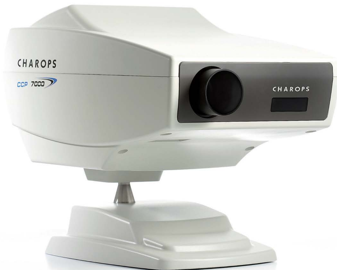
Chart Projector CCP-7000