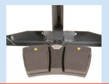
Foot keypad enables quick and easy electromotive height adjustment.