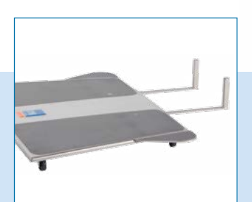
Optional: adaptable foot switch plate. No. 31040005

Anatomically formed, ergonomic backrest reduces pressure on ideal support for the lumbar