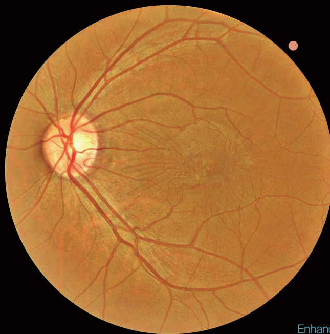
Enhanced Visualization Technology : EVT

Thanks to Low Intensity of Flash, Speedy Capturing, Auto Tracking & Auto Shooting, HFC-1 provides High Stability and Ease of Use.