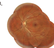
Panoramic (Non-Mydriatic Composite Retinal) Image

The function provides major information to general evaluation for eyes since users can acquire high resolution images minimizing distortion.